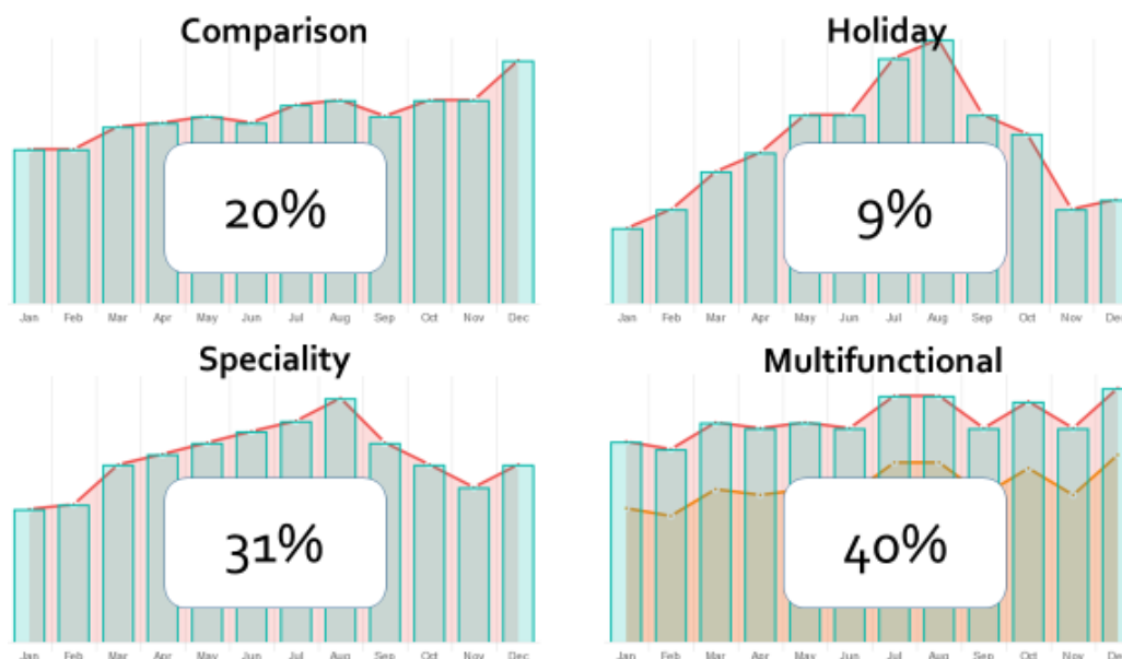
Figure 1: Britain's town types

Understanding what type of town you are, means you focus on doing the right things for your town. Actually knowing what type of town, depends on having a minimum of two years footfall data to avoid rogue data, but often people trading in the town will have a good insight when they compare the town types.