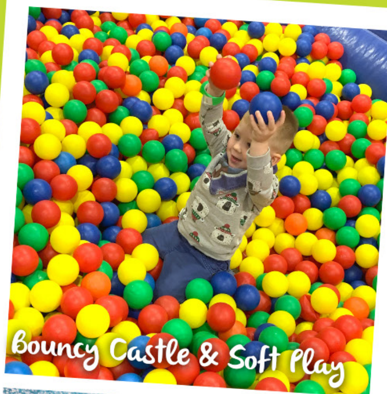
Bouncy Castle & Soft Play