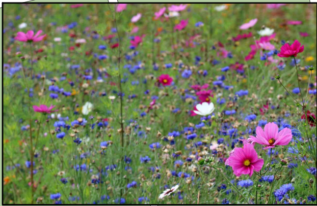
Parts of land planted with meadow grasses that encourage butterflies bumblebees and bees

Solitary bee hives to be installed to improve biodiversity.