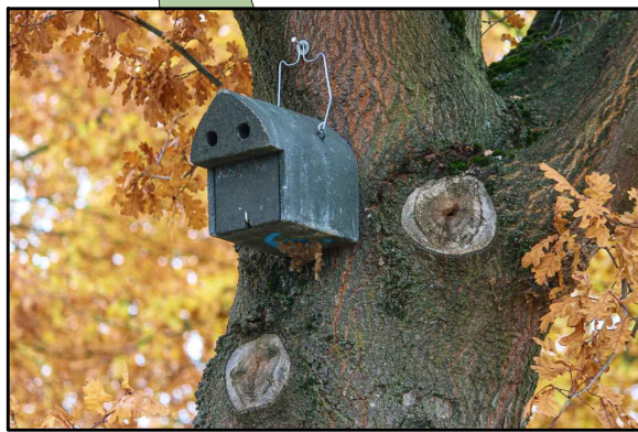
The addition of standard bird and bat boxes to be installed on retained trees

Existing hedge to be widened with native species and grown to 3m high to provide year-round screening