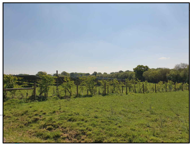
New hedgerow boundary, mixed native hedgerow species to match.

New Extra thick hedge planted to provide year-round screening from properties, interspersed with semi-mature trees (2-3m high at planting) to provide immediate landscape benefit